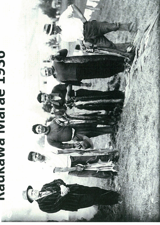
Raukawa Marae 1936